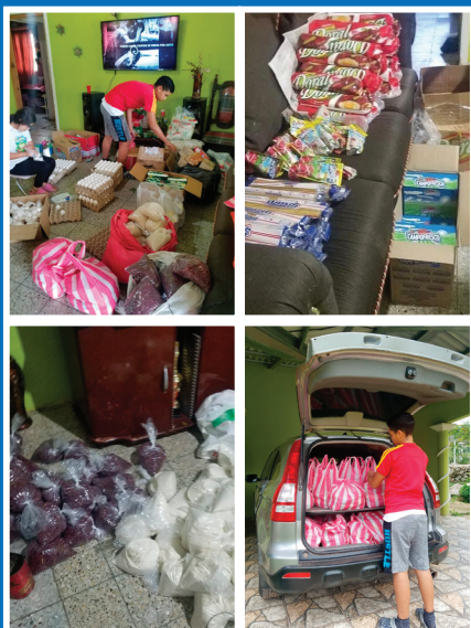
Food being bagged and ready for distribution.