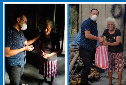
84 year old lady gave her heart to Jesus

Please pray for us as we hope to be back to Honduras soon! Our hearts long to be with the Honduran people during this difficult time. We know that our God is Sovereign and in His perfect timing we will get to go back and minister to the people in Tatumbula as we watch His kingdom grow and prosper.