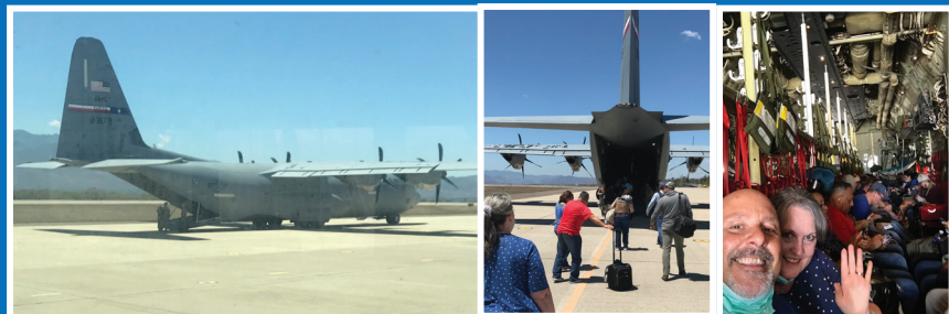
Our flight aboard a C130.