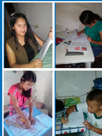
High School Students