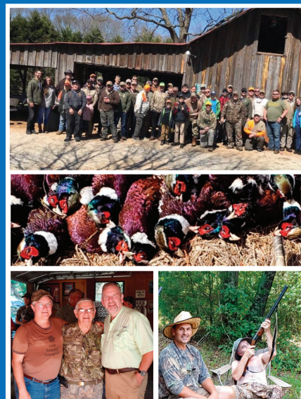
The annual Pheasant Shoot at Hartland Farms