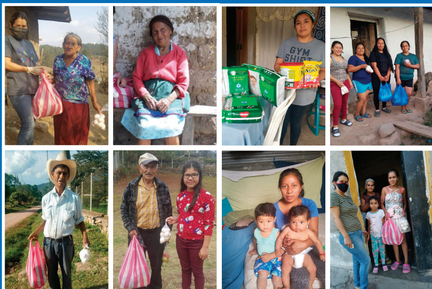
Food being distributed to the people in Tatumbula