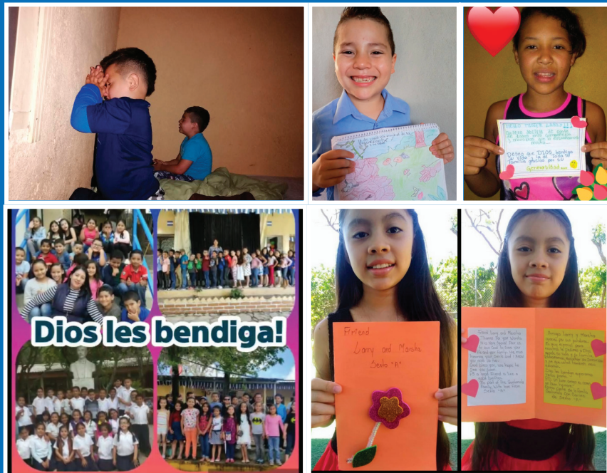
Notes, letters, and videos from school children